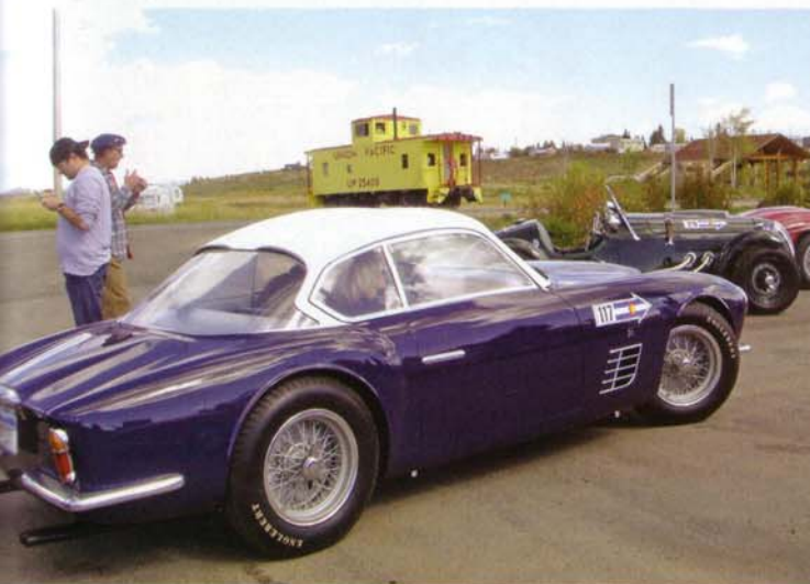
Sydorick's 1956 Ferrari 250 GT Zagato