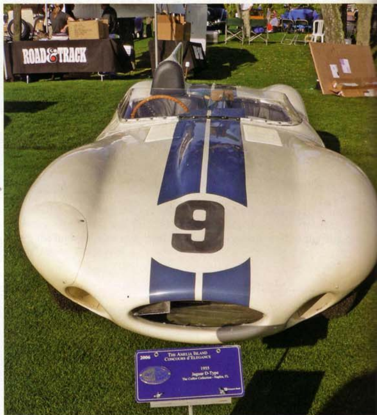
Collier's 1955 Jaguar D-type